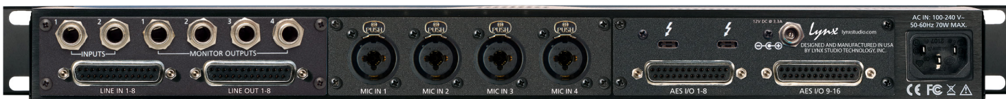
Aurora (n) rear panel with LM-A24 module.